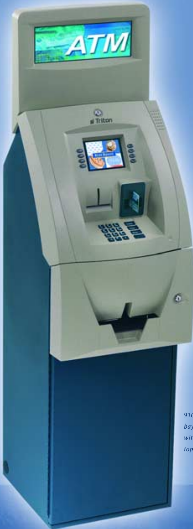
9100 in bayou bronze with backlit topper

The 9100 is our best selling ATM. This extremely popular machine was designed to be the lowest cost high-performance ATM in the industry. And it has proven to be perfectly suited for owners who need functionality and performance at a lower price point.