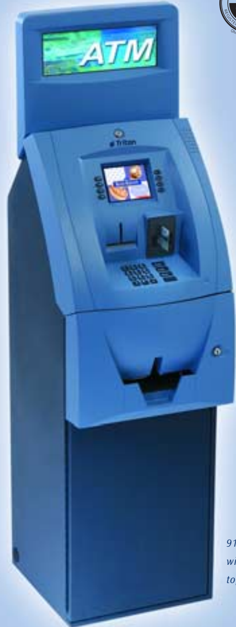
9100 in blue with backlit topper